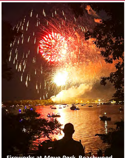
Fireworks at Mayo Park, Beachwood

OCEAN COUNTY is more than just a perfect Summer Getaway! We have Festivals, natural wonders, and exciting attractions every season of the year!