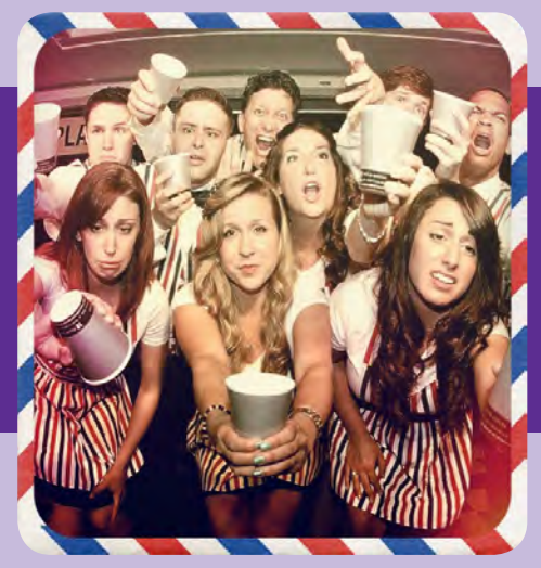
The Music Man Singing Ice Cream Shoppe Lavallette