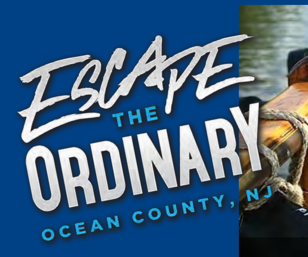
Pirate Adventures of the Jersey Shore, Brick Twp