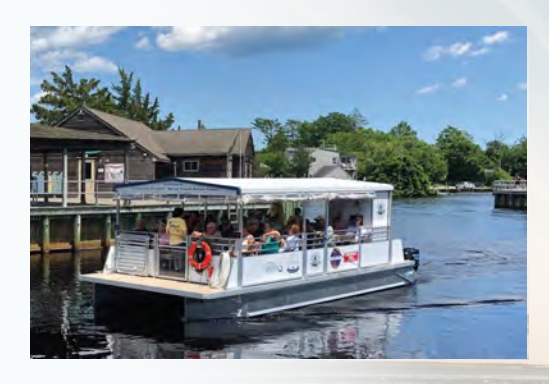
The LBI Ferry from Tuckerton Seaport to Beach Haven

Ocean County has more than a dozen museums and historic landmarks, many highlighting local maritime history. The statuesque Barnegat Lighthouse is an iconic attraction, where our visitors can ascend 217 steps to view our spectacular Atlantic coast line.